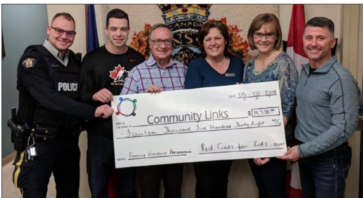
HOCKEY HEROES - Airdrie RCMP and organizers from the Red Coats for Kids Charity Hockey Tournament present a $14,538 donation to Community Links March 5. The funds were raised at the Jan. 25 to 27 tournament in Airdrie that saw RCMP officers from across the province participating to raise money for a local charity in the host city. The funds will help support programming and family violence initiatives at Community Links.